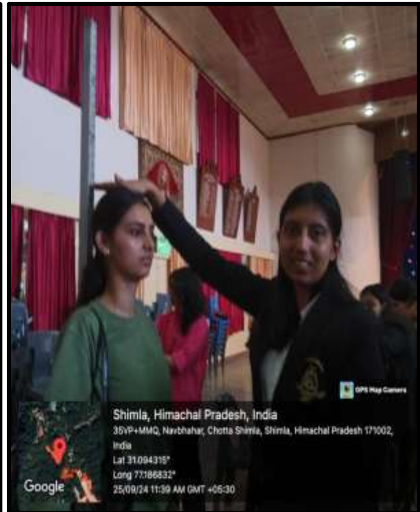
Workshop on Health and Dental Care (September 25, 2025)