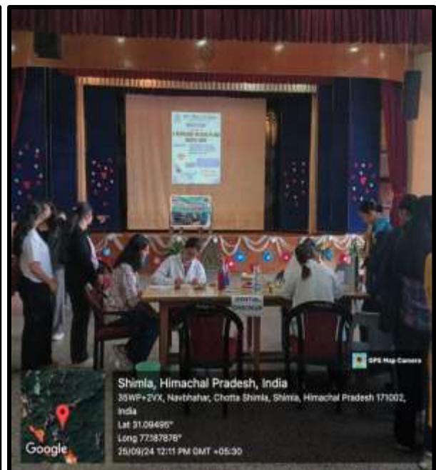
Workshop on Health and Dental Care (September 25, 2025)